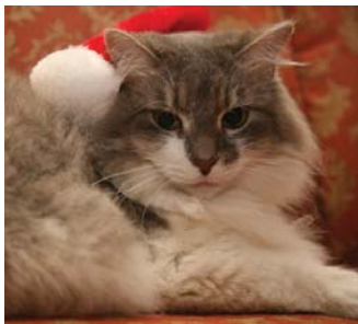
Merry Christmas from Squirt!

Living with a serious illness can impact every part of your life. You may experience new emotions or have spiritual questions; you may notice physical changes. Remember information and support is available to you. Hospice of Marshall County is here to serve you and answer any questions you may have in regards to end-of-life care. Call us today at 1-888-334-9336.